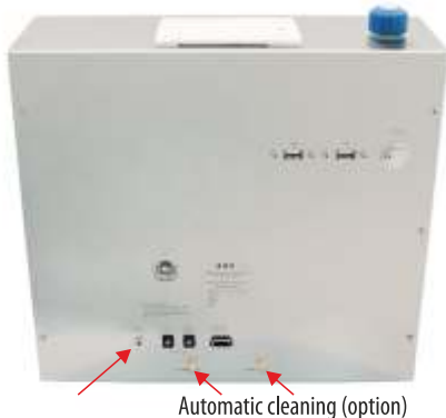
Automatic cleaning (option)